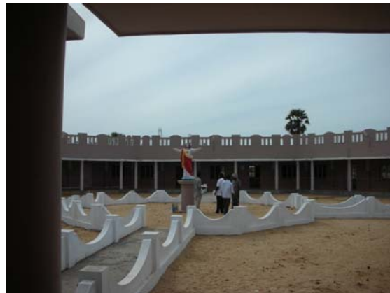
Interior Garden Area

Please contact us by email at staff@mercyhomefoundation.com to find out how you can be a part of this cause.