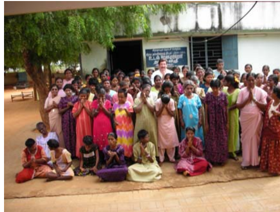
Mercy Home staff and residents thank you

Admission to the Mercy Home is open to parentless, abandoned, destitute, and neglected ones; those who are physically and mentally challenged – all need love, care and protection.