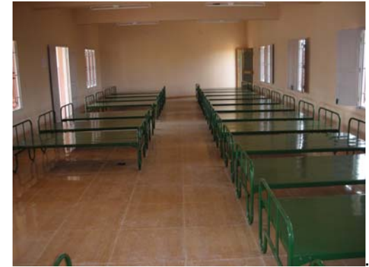
1 of 4 Dormitories

This project is being constructed adjacent to the current buildings, capable of housing up to 100 women. The new facility has several dormitory areas with new beds, modern bathrooms, kitchen and dining hall, a large indoor recreation area,