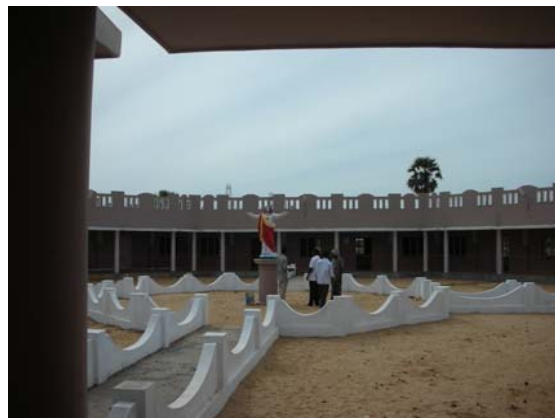
Interior Garden Area

Please contact us by email at staff@mercyhomefoundation.com to find out how you can be a part of this cause.