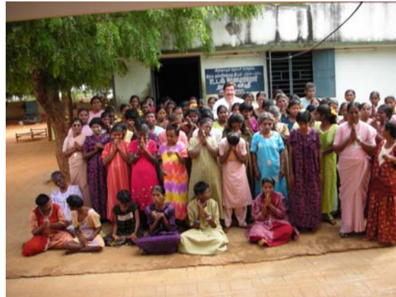
Mercy Home staff and residents thank you

Admission to the Mercy Home is open to parentless, abandoned, destitute, and neglected ones; those who are physically and mentally challenged – all need love, care and protection.