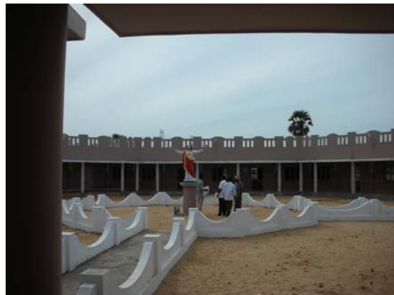
Interior Garden Area

Please contact us by email at staff@mercyhomefoundation.com to find out how you can be a part of this cause.