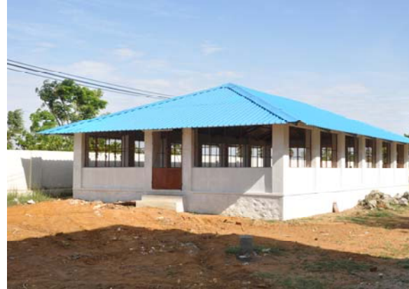
Temporary school quarters.

Our goal is to build a school capable of handling 25 students in classes of no more than eight students to each instructor. In addition to classrooms we will also have a speech therapy area and a physical therapy room.