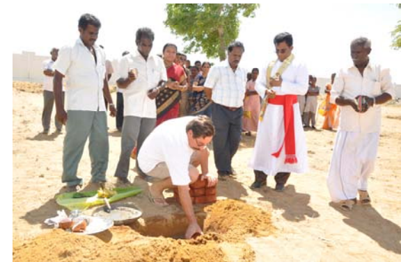
First bricks are laid.

The Mercy Home Foundation operates with an all volunteer staff. There are no paid employees. All money donated goes directly to the projects.