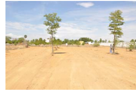
Land has been cleared

The JACID complex currently houses a trade school (JACID) and St Anthony's College. The Angel Nagar Day school will be temporarily set up in this cafeteria currently on the grounds.